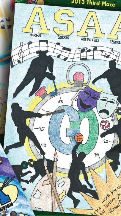
2013 Third Place